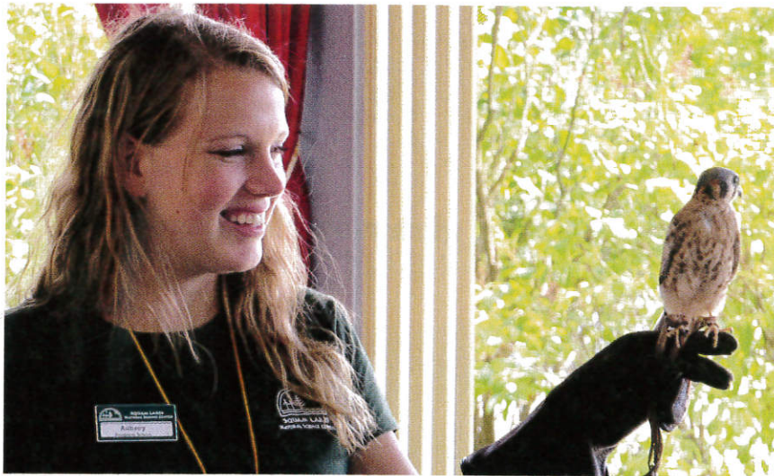
A naturalist from a nearby nature center displays a peregrine falcon during the line's Nature by Rail program, which is offered on Saturdays through August.

and Montreal Railroad, which built the line in the late 1800s. In its heyday, it brought tourists and vacationers from Boston and New York to the grand hotels in the White Mountains for summer holidays. Later, when automobiles gained primacy, the line mostly carried freight, but that too eventually dwindled out.